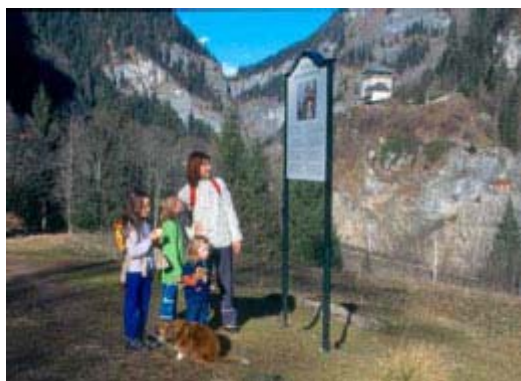
Along the Legend Walk

Starting at the Unterberg part of the village turn right behind the Amoserhof. Walk along the signposted and marked walking path (transport path). Along this route there are a total of 10 Legend Boards, on which legends can be found both in words and pictures. After crossing the Bernkogel river, walk steeply uphill, following this the route is mostly even and slightly downhill while walking in a northerly direction. The varied walk leads sometimes through forests, but mostly over fields and pastures, passing the “Schlossalm” (walking stamp at a bench) and a power station to the “Gasthof zur Ruine” (guest house) in Klammstein. Here it is possible to catch the local Post Bus back to Dorfgastein.