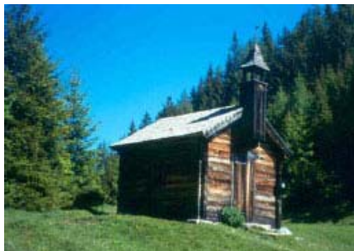
The Drei Waller Chapel

Leading out of the Unterberg part of the village behind Amosergut along the transport path uphill. Over the Bernkogelbach and now over a sunny slope following the transport trail in the direction of the Drei Waller until the Huberalm. Turn left and use the walking path as a short cut until reaching the transport path again, or carry on along the transport path, passing the “Calcit Hohle” a crystal cave with lots of calcite - now turn westwards until the road turns right to the Drei Waller Chapel. There is a walking stamp at the chapel. A walk to the Kögerlalm from here will take ¼ hour. There is also a transport path leading northwards and downhill to the Kögerlalm. Beautiful views from here to the Salzach Valley as well as the Hochkönig and the Steinernen Meer.