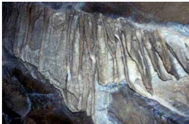
Curtains in the natural cave

The Entrische church is a natural cave that served as a shelter in the 16 th century for protestants that were on the run, it has beautiful stalagmites and curtains. Many kilometres in the cave have been discovered; about 500 metres are accessible and have been secured. They can be visited while taking part in the “short cave tour”. The entrance can be reached from the Klammstein Car Park, (bus stop). There is a walking path that is also a nature trail where many different presentation boards inform about our mountain world especially the fauna and flora. After approximately 50 min.